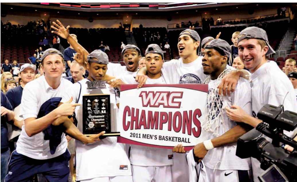
WAC CHAMPIONSHIP FOR AN EXCITED TEAM OF AGGIES IN LAS VEGAS LAST MARCH.

its current school records in each category.