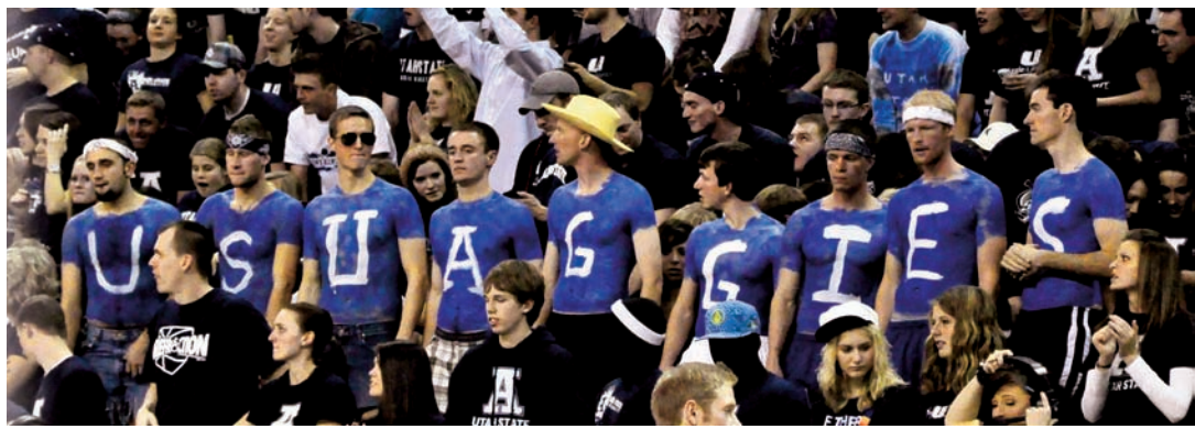
A FAMILIAR SCENE IN THE SPECTRUM IS A PACKED STUDENT SECTION CHEERING ON THEIR TEAM.

Earned first-team all-WAC honors and was named to the league's all-newcomer team after averaging 11.8 points, 3.4 assists and 3.1 rebounds per game, while shooting 43.6 percent from the field (123-282), 21.1 percent from three-point range (16-76) and 80.2 percent at